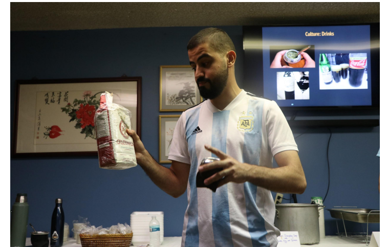
Other programming includes cultural events such as Global Cafes where presenters speak on a cultural topic.