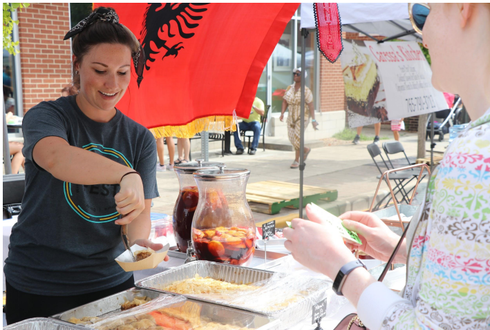
International Food Bazaar is now a part of West Lafayette's Global Fest in the Fall.

Tenants are welcome and encouraged to participate in all IC programming. Please sign up for our email notification list or watch our Facebook and Website.