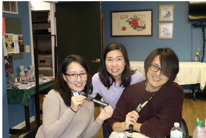
Join one of the free English and other language Conversation Groups to practice speaking and listening & make new friends!